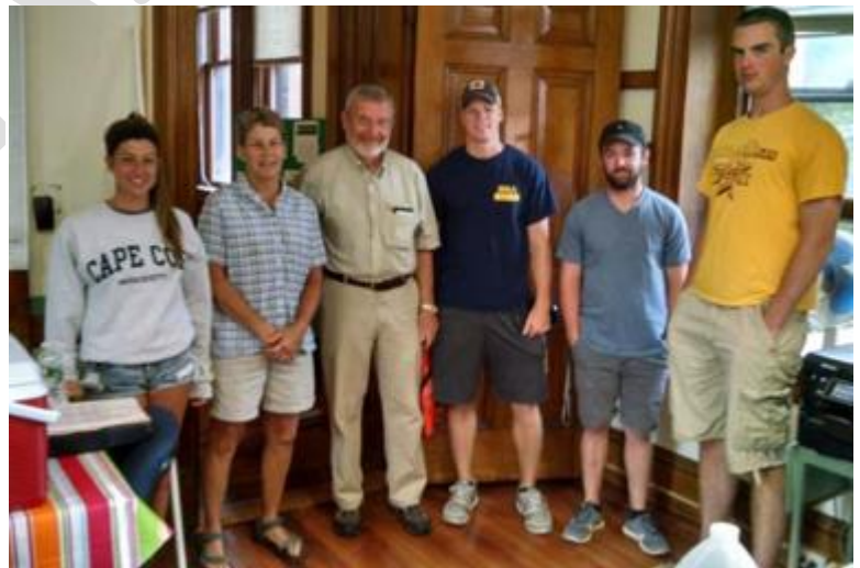
Fig. 2. BBAC staff working on the stormwater collaborative during the summer of 2016.

The Buzzards Bay NEP provided two staff persons (stormwater monitoring and mapping specialists) and a portion of the NEP Director and NEP Administrative Assistant's time. The NEP Stormwater Specialists were responsible for developing and finalizing an EPA approved Quality Assurance and Project Plan (QAPP) for the stormwater monitoring program, providing